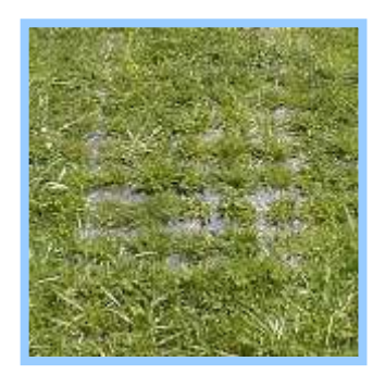
Grass grows back through the tiles

Further details available at: www.perfo.co.uk