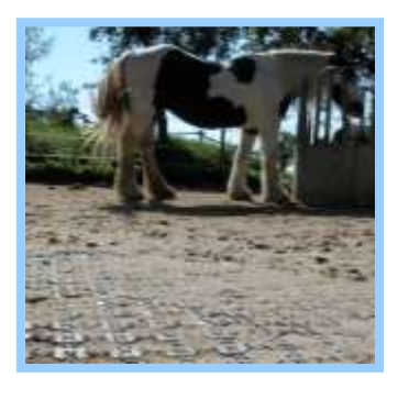
Transforms soft ground into a stable base