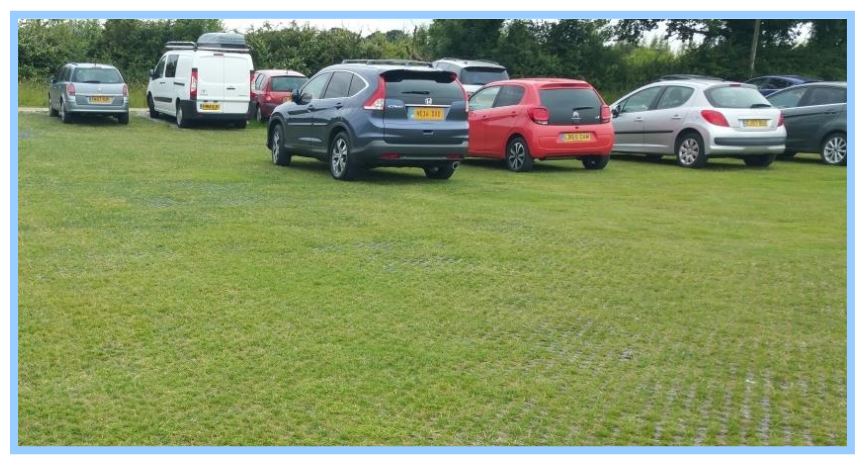
Transforms soft ground into a stable base